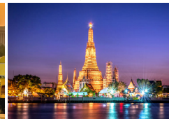
Bangkok, Thailand, August 14, 2018