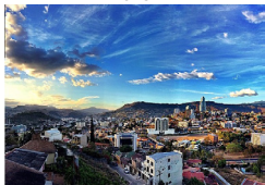
Tegucigalpa, Honduras, July 23, 2018