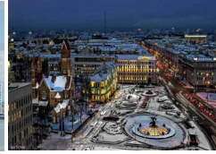
Minsk, Belarus, June 05, 2018