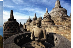
Yogyakarta, Indonesia, October 19 - 20, 2018