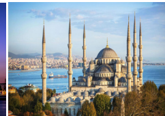
Istanbul, Turkey, October 15, 2018