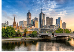
Melbourne, Australia, May 18, 2018