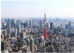
Tokyo, Japan, May 08, 2018