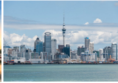
Auckland, New Zealand, May 21, 2018