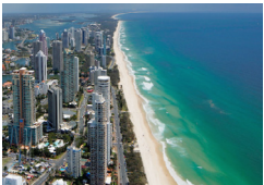
San Jose, Costa Rica, July 20, 2018