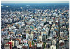
Dhaka, Bangladesh, May 12, 2018