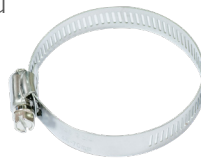
A hose clamp included